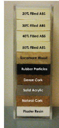
Fig. 1: The 10 cartridges of the CCR radiomics phantom.