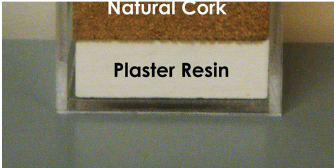
Fig. 1: The 10 cartridges of the CCR radiomics phantom.